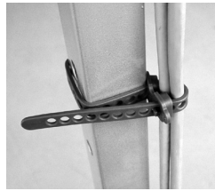
Can secure in double loops