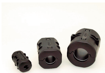
Housing with anti-slip-means